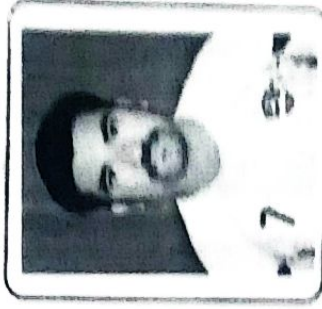
Sign. State Secretary

Stani Mamorial Engineering College PHAGI, Jaipur, From 25th to 28th May 2016.